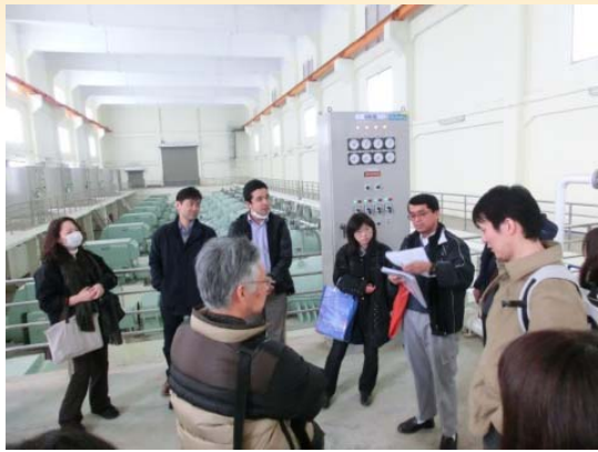
Yen So Pumping Station