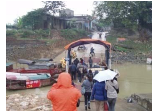
Vinh Phuc Province Investment Climate Improvement Project