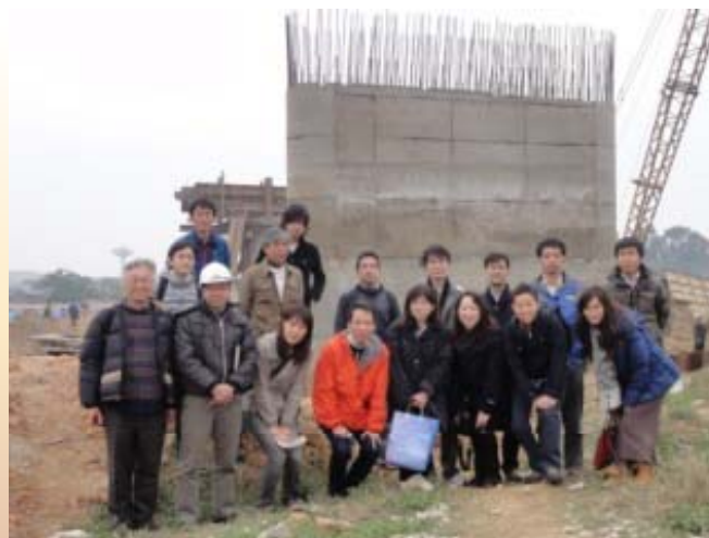
New National Highway No. 3