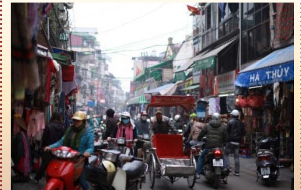
The Old Town in Hanoi