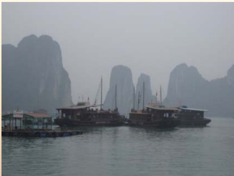
Ha Long Bay (The World Heritage)